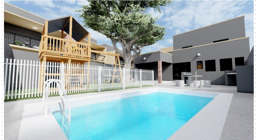
Communal Entertainment Area