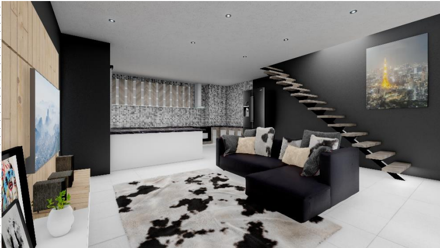
Open Plan Kitchen and Lounge