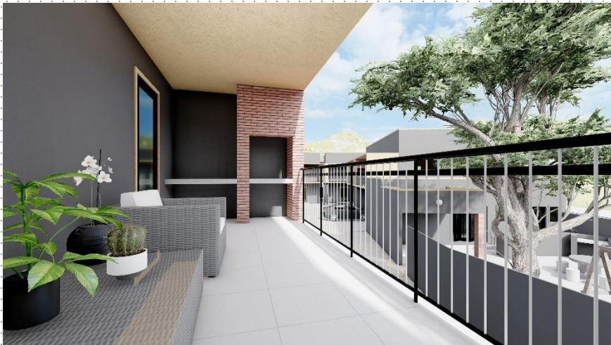
Balcony with Built-In-Braai